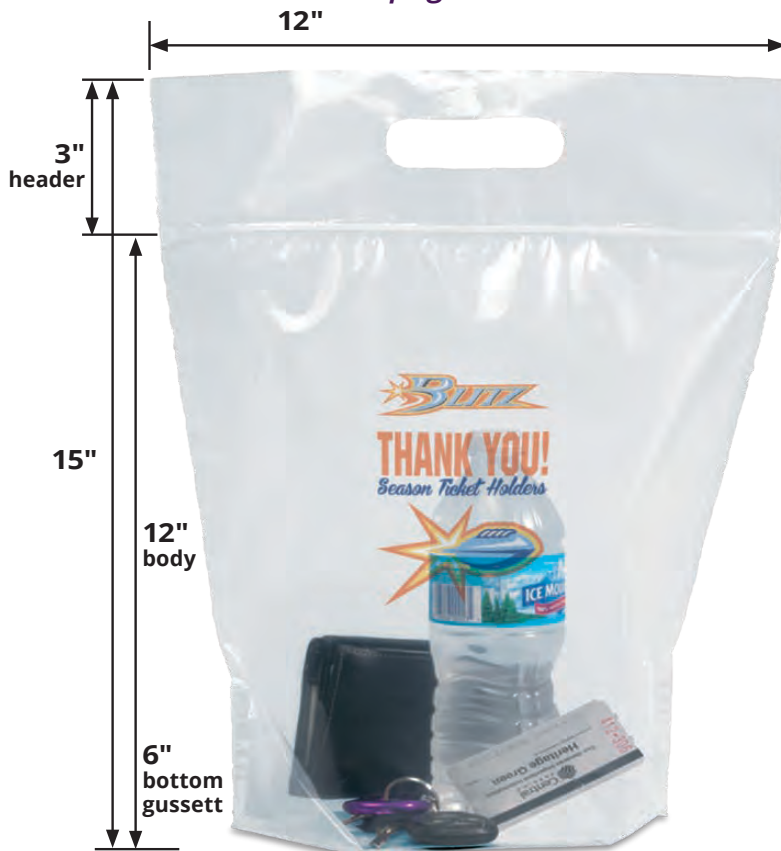
ZIP-CLOSE DIE CUT BAG Clear only.

Looking for custom options or an exclusive-to-you designed bag? See page 200.